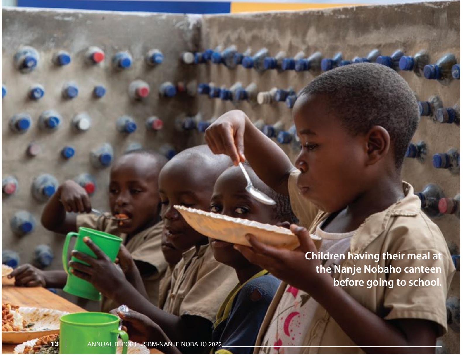
Children having their meal at the Nanje Nobaho canteen before going to school.